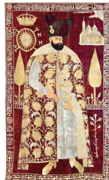
Embroidered tomb cover of Prince Ieremia Movila, Suceviţa Monastery Museum

Thursd: 8:30 am - Today we will leave early as we have a long but enchanting drive, about 300 km. Stop at Pasul Tihuţa (alt 1,200 m) between Transylvania and Bukovina;