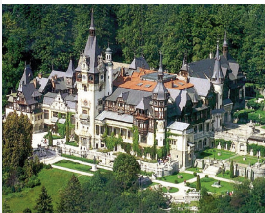
The Peleş Castle in Sinaia