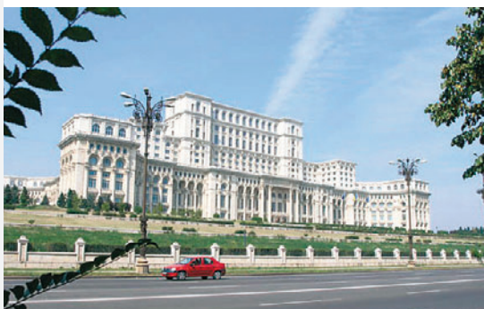
The House of the Republic, Bucharest