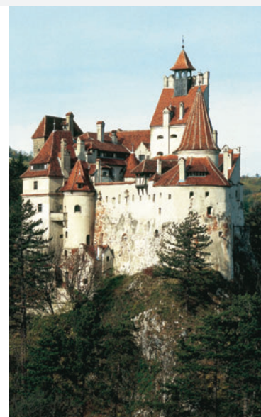
The 'Dracula' Castle in Bran

8:00 pm - Dinner followed by a short walk to the medieval town-centre to admire the great Market Square, the City Hall and the Black Church by night.