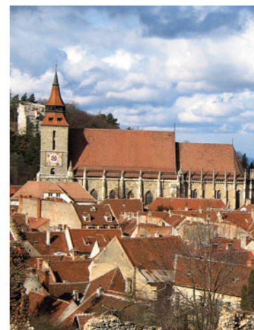
The Black Church in Braşov

8:00 pm - Dinner party at the 'Shepherd's House': local food (sheep cheese and lamb) and folk music. Return to Braşov and stop to admire the town by night.