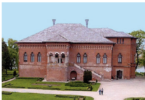
The Mogoșoia Palace