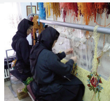
Nuns weaving kilims at Agapia Monastery

7:00 pm - Accommodation in Voroneţ. Optional walk. Dinner at the hotel restaurant.