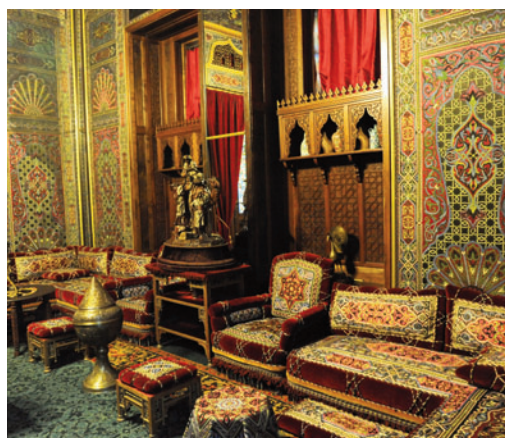
Peleş Castle: Oriental Room