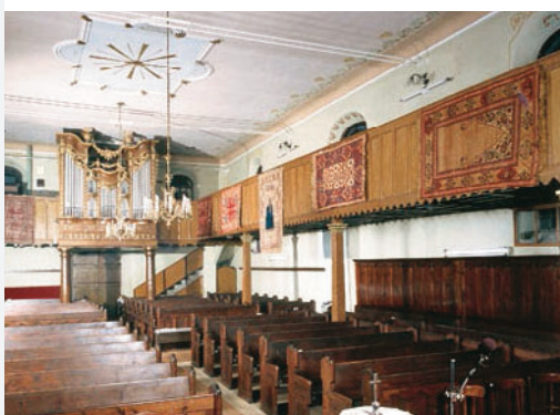
The Hungarian Church in Braşov