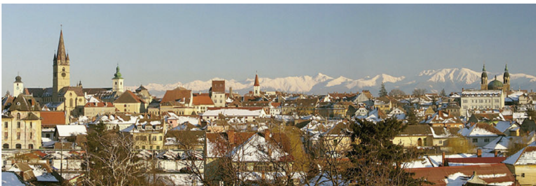
Landscape in Sibiu