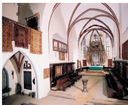
The Monastery Church in Sighişoara