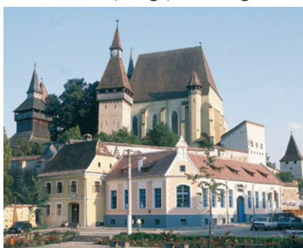
The Lutheran Church in Biertan