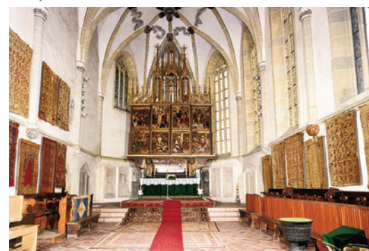
St. Margaret Church in Mediaş