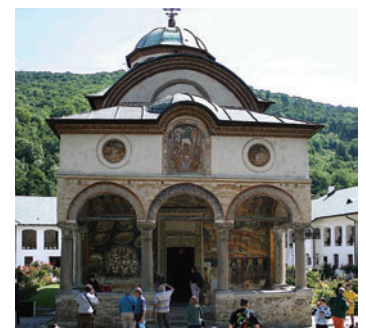
Cozia Monastery, 14th cent.