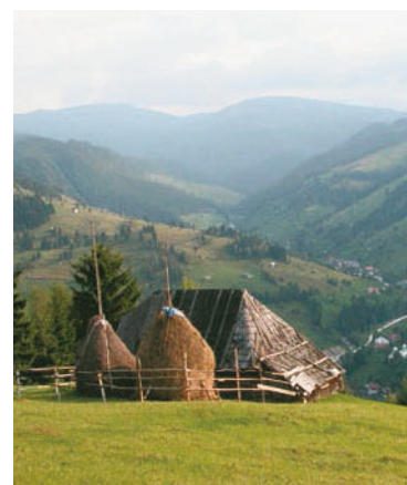
Landscape near Bran