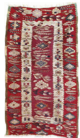
An Oltenian kilim ( scoartza ) Romanian Peasant Museum